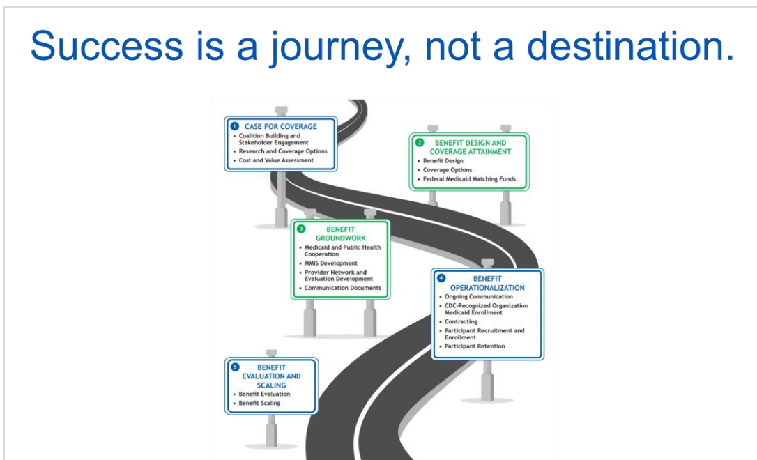
Policy to Payment Roadmap

They reminded participants that success is a journey and not a destination and to celebrate each milestone and win. Medicaid coverage for the National DPP lifestyle change program will continue to be a priority for CDC and NACDD, and we are here to support states with their technical assistance needs.