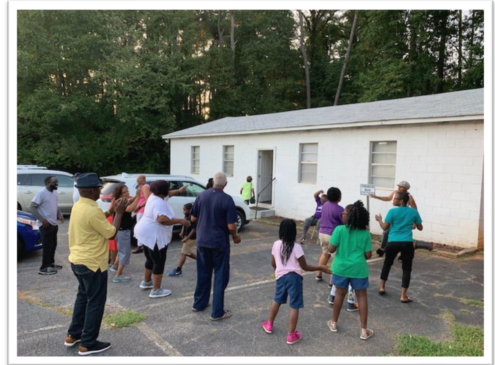
Mt. Zion First Baptist