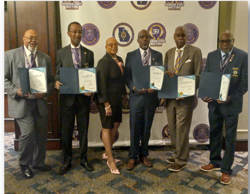
59 th Annual Omega Psi Phi State Meeting, October 2022